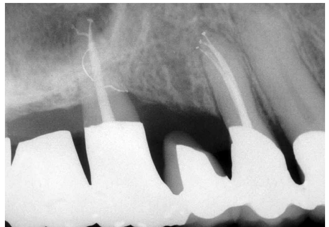
Figure 1b. Three-dimensional endodontic retreatment is the foundation of perio-prosthetics.