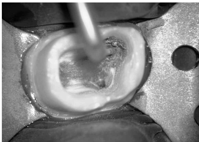
Figure 5. A photograph demonstrates an ultrasonic ProUltra Endo Tip vibrating MTA into the MB canal and related perforation.

Despite all the promises in the future for greater clinical satisfaction, clinicians must still work on the fundamentals that provide success. The one thing that has never changed in the history of mankind is root canal systems and their infinite range of anatomical variability. The one thing to remember is that proven concepts tend to endure whereas instruments and techniques come and go. There is an old expression for wise clinicians to consider: "Give a man a fish and he will eat for a day...Teach a man to fish and he will eat for a lifetime". ▲